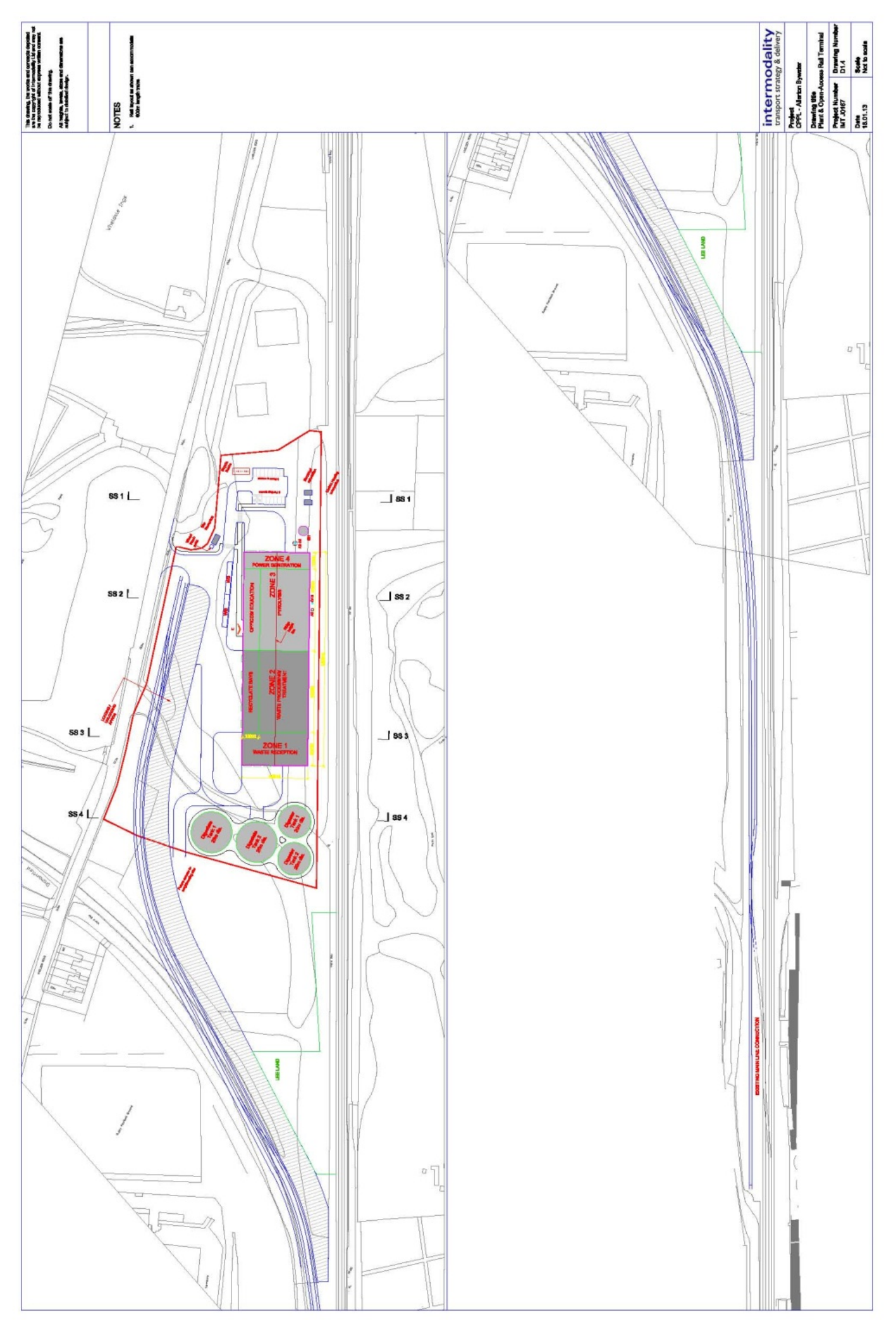
Page 10 of 25