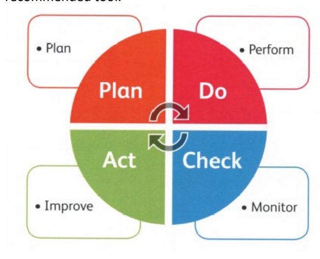
Figure 3 The Plan-Do-Check-Act process

structured way. This approach is directly transferrable to the management of issues such as performance and Customer Information Provision and therefore this has been included as a recommended tool.