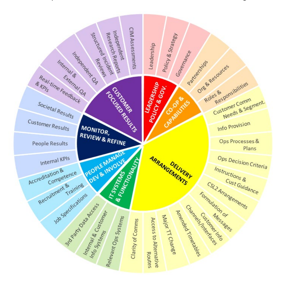
Figure 4 Schematic Representation of the CIM Excel Model

The seven CIM Components and 34 Elements are illustrated in the following schematic.