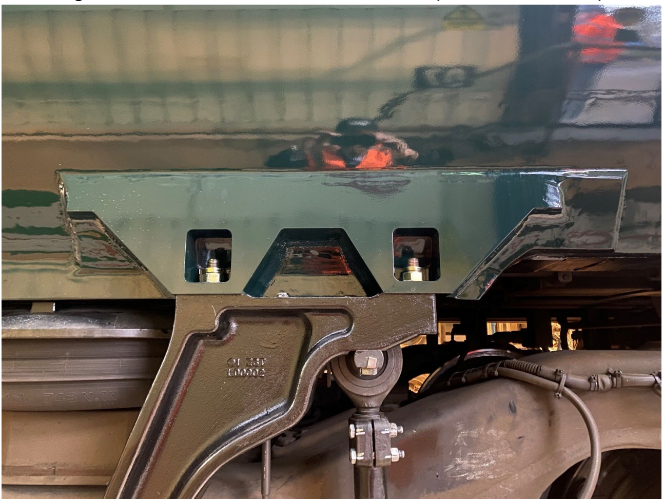
Figure 4.1 Hitachi's modification of bolster area (intermediate vehicle)