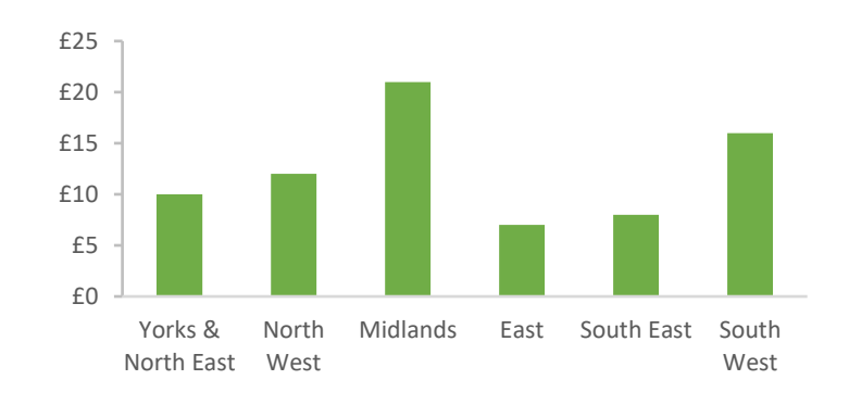
Fig 2: Total cost of DF schemes by theme (£m), 2020/21