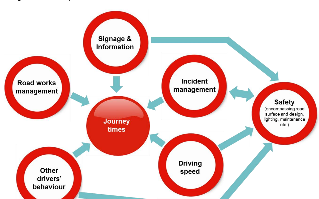
Diagram 1: How priorities are interlinked for drivers

Safety , on the other hand, was rarely mentioned as an issue spontaneously but has featured as rationale for being concerned about a range of other specific issues (e.g. surface quality, surface water, lighting etc.). Still, it was another area like journey times which respondents saw as strongly related to some of the other performance themes, such as driving speed , incident management , other drivers' behaviour and signage and information . The diagram below shows respondents' perception of the relationships between these different performance themes.