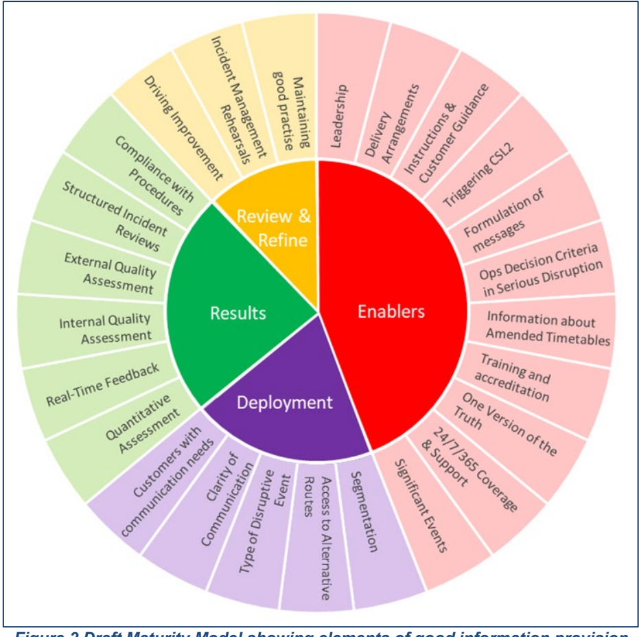
Figure 2 Draft Maturity Model showing elements of good information provision