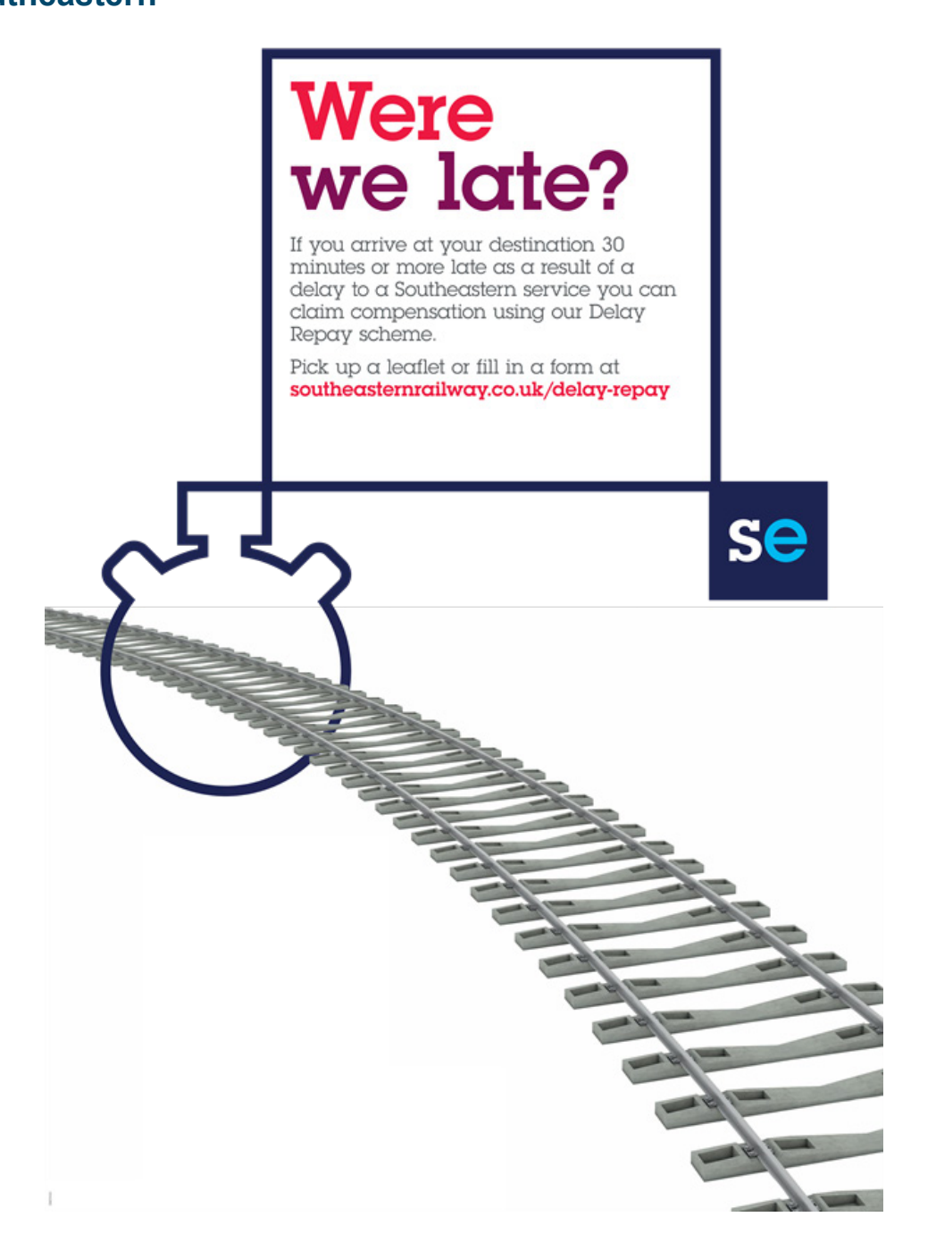
Figure 2.3 Current Delay Repay passenger information poster from Southeastern