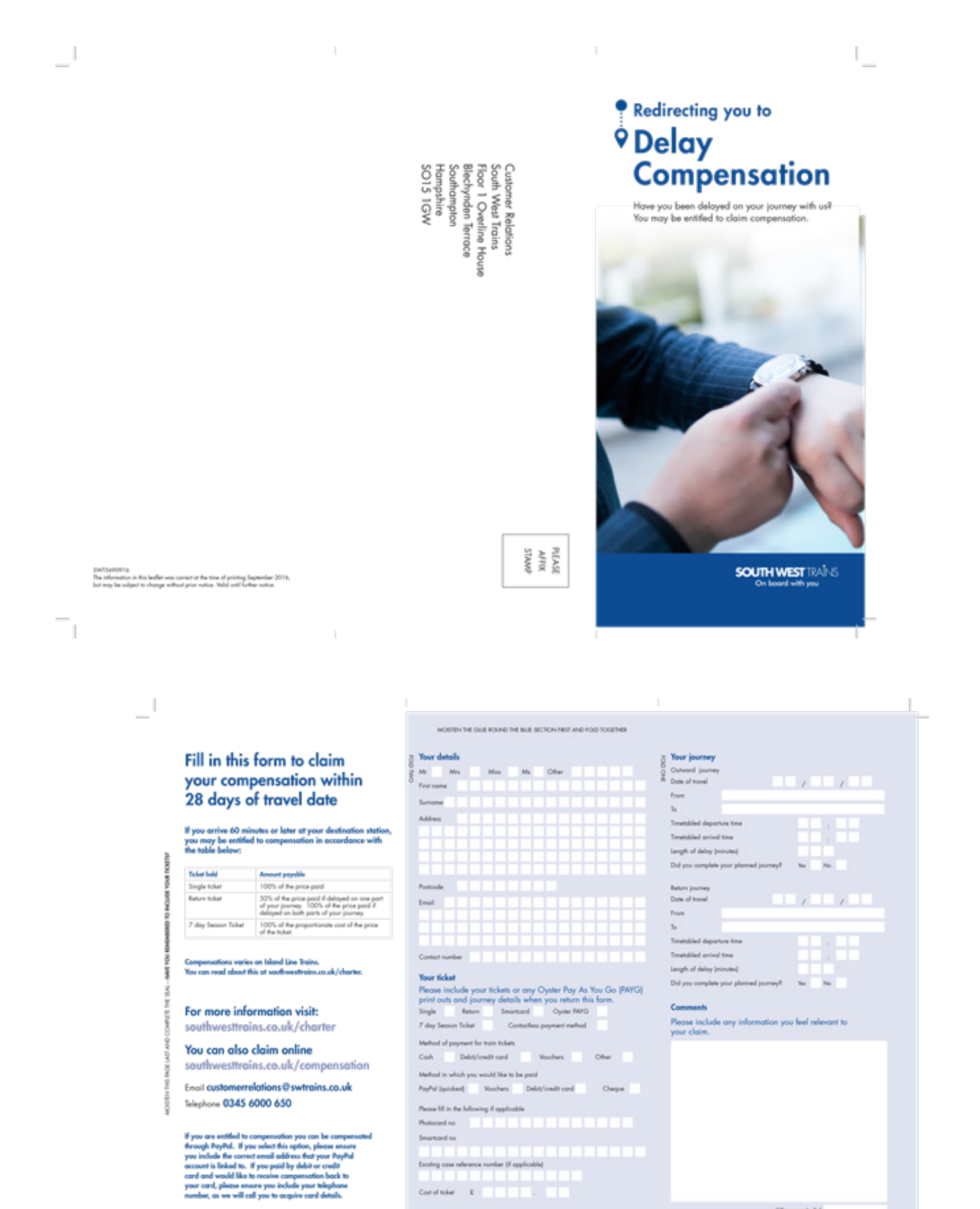
Figure 2.2 South West Trains printed compensation form - November 2016