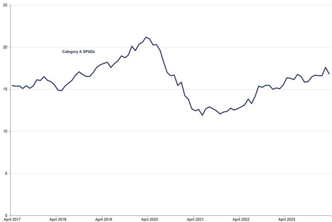
Figure 4: SPADs

There has been an increase in the most serious (category A) SPADs which are attributable to drivers actions over the last 3 years. In March 2023 the annual moving total was 10 Category A SPADs and in March 2024 it was 13 SPADs. We continue to investigate all Category A SPADs because of the potential for a catastrophic outcome along with incidents where drivers have significantly exceeded the line speed (over speeding).