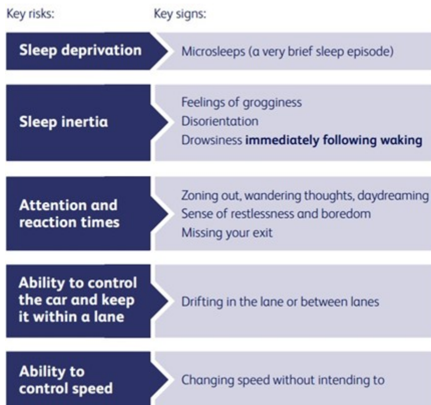
Figure 10.1 Risks and signs to look out for when driving