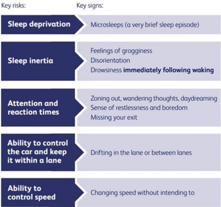
Figure 10.1 Risks and signs to look out for when driving