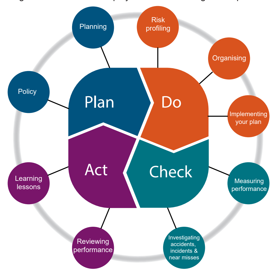
Figure 1 The Plan-Do-Check-Act cycle (HSG 65 2013)