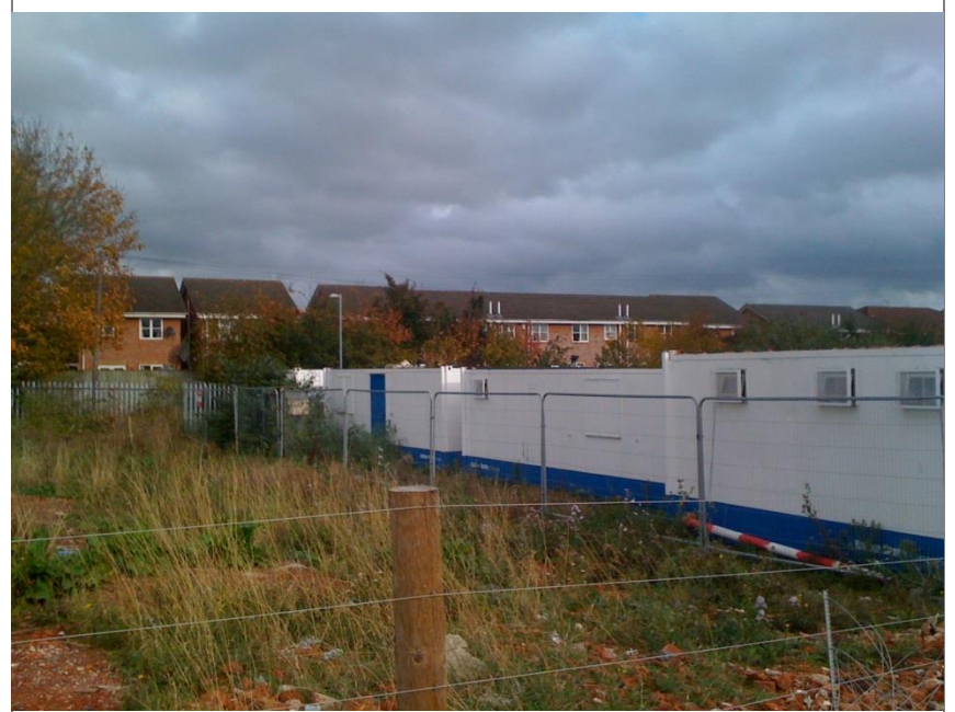
View of Obridge Yard showing the residential context immediately to the north