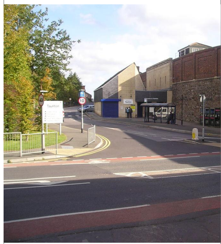
View showing the access route into Obridge Yard from Station Road (Kilkenny is to the left behind the trees)