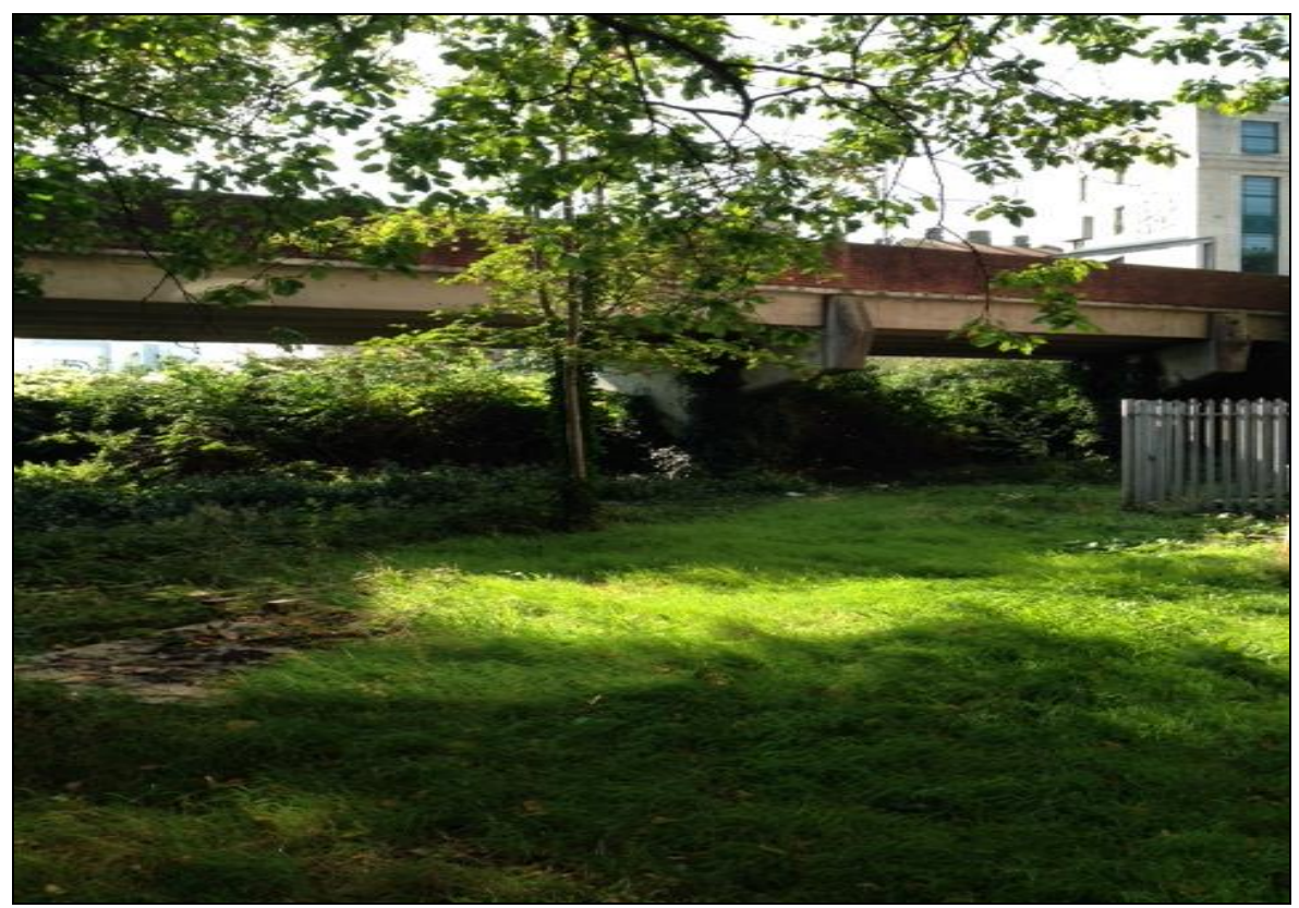
Photo 3 - View of site looking south from Network Rail land adjoining station building (site beyond over-bridge).