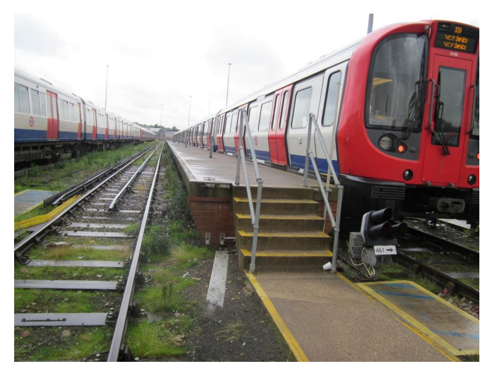
Access platform, 2.4m wide, with railed steps and conductor rails on distant side