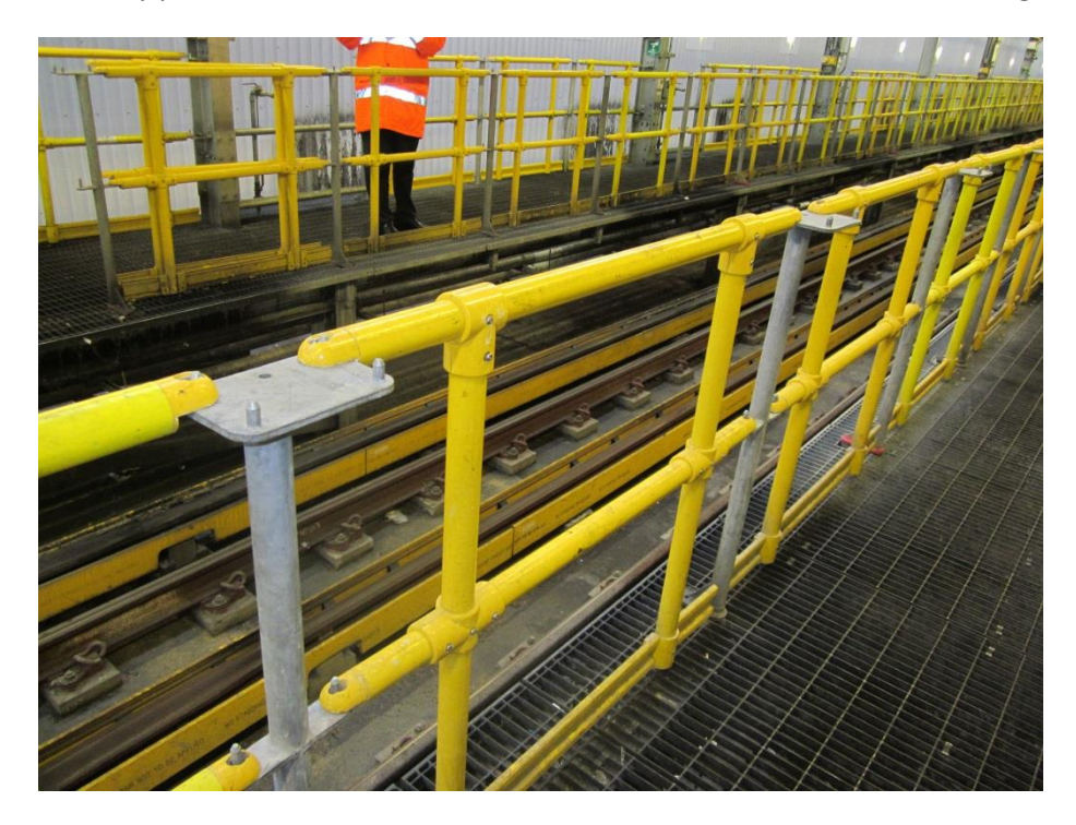
Full-length platform edge railing system with lightweight removable sections

17. Train servicing activity generally involves fairly short-duration, quick throughput working, for reasons of 'reasonable practicability' commonly undertaken without an isolation of the conductor rail. (Access to a train from a well-designed raised platform, for the purpose of interior cleaning, should pose no electrical risk to staff.) Where contact with live conductors is effectively prevented, and where there is no chance of indirect contact through wet