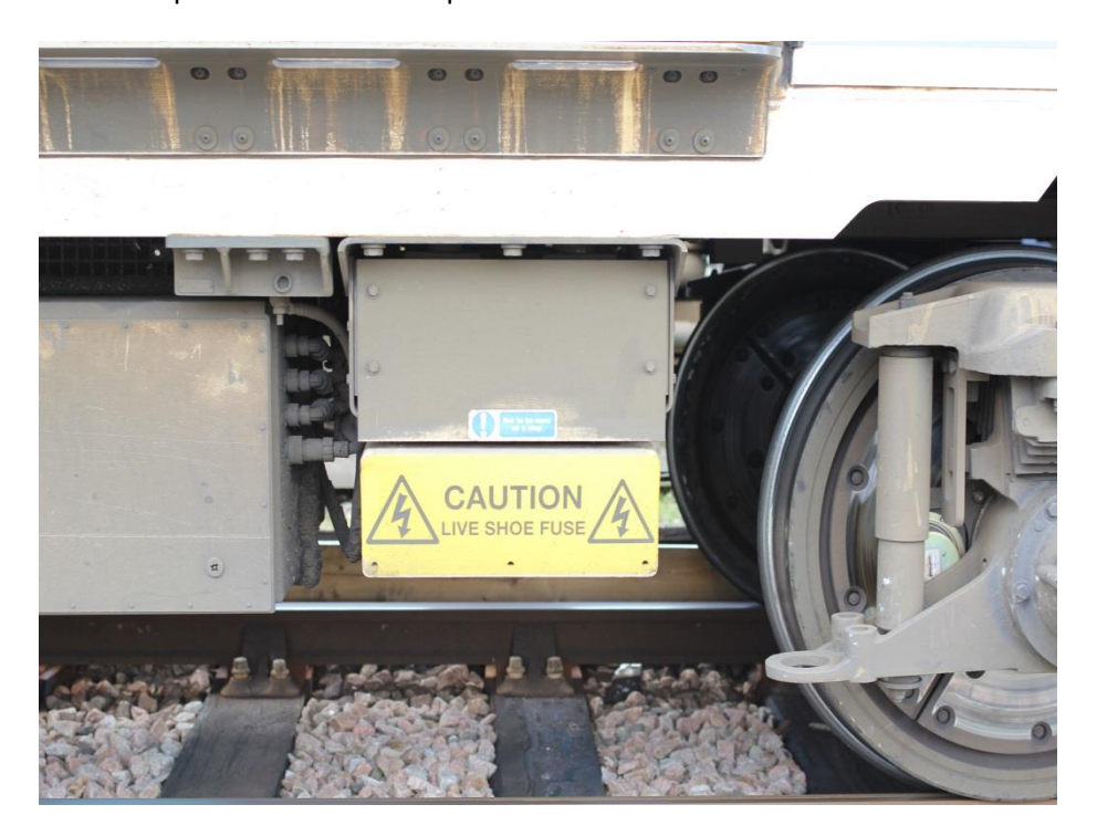
Simple cover fitted over shoe fuse

For ballast-level train servicing activities, such as tanking and sanding, effective shielding of live shoe gear can be provided by fixed raised boarding installed alongside the known stopping positions of train shoe gear. Such boarding might be in the region of 500mm high, though optimum dimensions and the extent of fitment will vary according to rolling stock characteristics and train servicing requirements. The boarding should be made of a