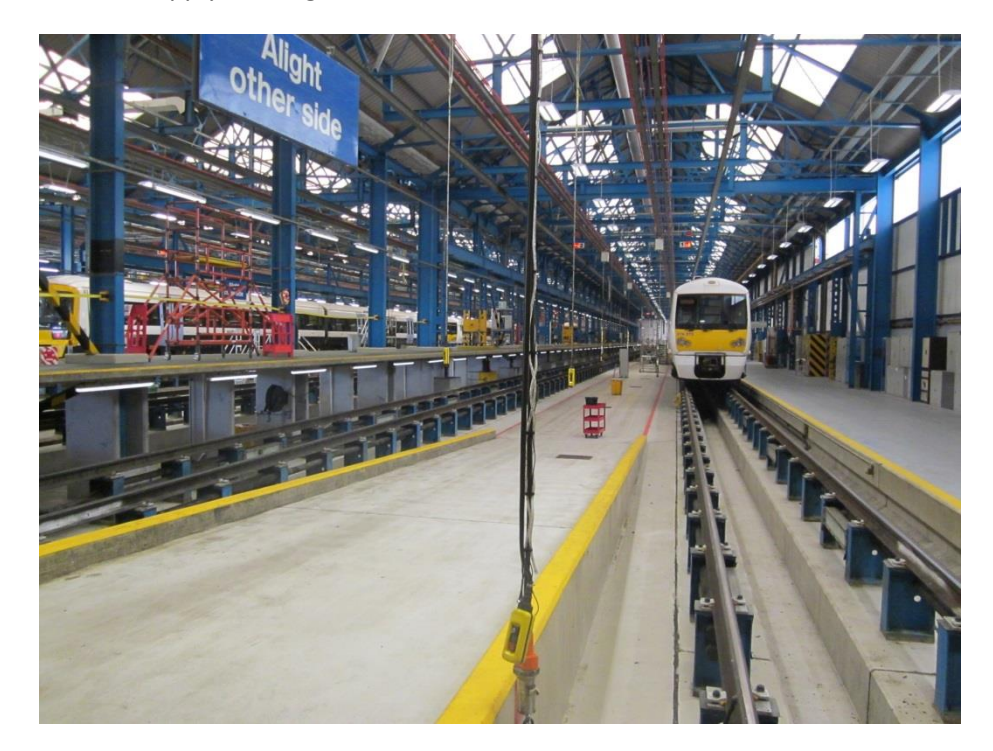
Conductor rail removed and power provided by overhead 'shore supply' system

16. The opportunity to eliminate risk locally through, where practicable, the cutting back of conductor rail from buffer stops, crossing points and staffed servicing locations, such as sanding and tanking points, should not be overlooked. Note that the local absence of conductor rail generally does not mean that shoe gear is de-energised.