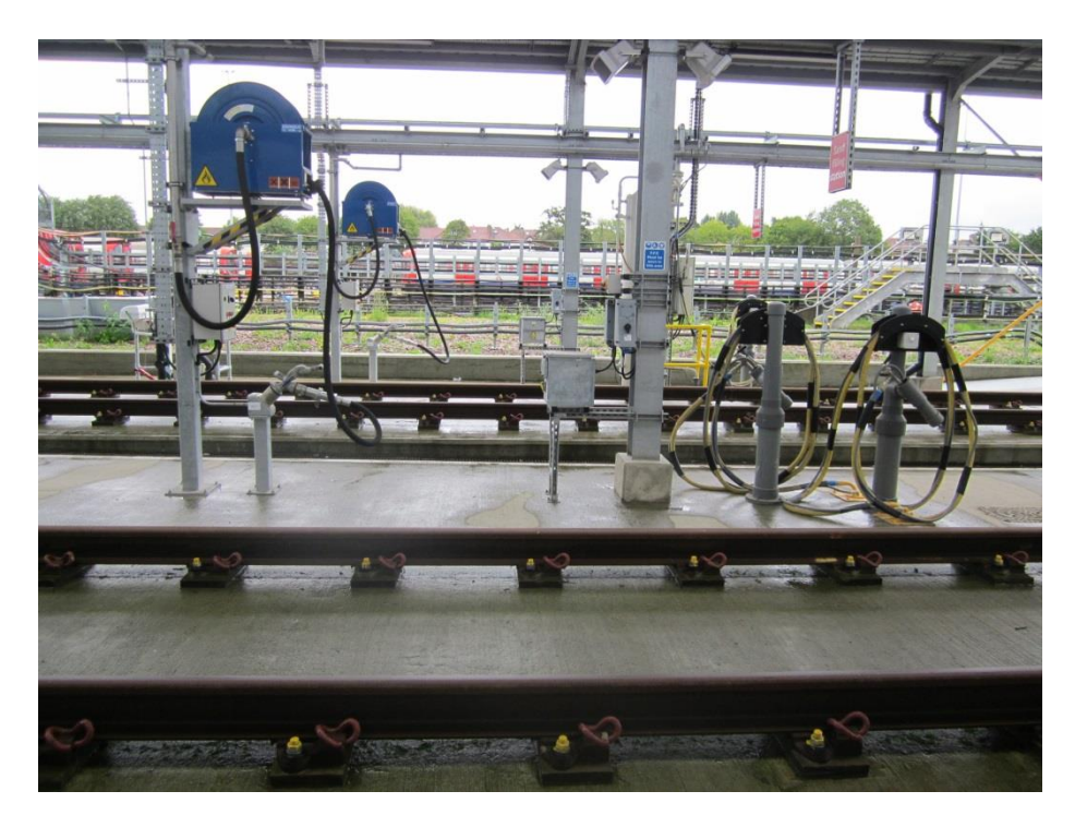
Conductor rail substantially cut back in vicinity of sanding and tanking point

17. Train servicing activity generally involves fairly short-duration, quick throughput working, for reasons of 'reasonable practicability' commonly undertaken without an isolation of the conductor rail. (Access to a train from a well-designed raised platform, for the purpose of interior cleaning, should pose no electrical risk to staff.) Where contact with live conductors is effectively prevented, and where there is no chance of indirect contact through wet